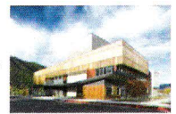
Jackson Hole Center for the Arts