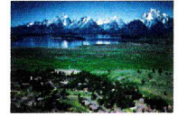
View from Jackson Lake Lodge

Join us in Grand Teton National Park and Jackson Hole with leading architects and critics to learn how we can all promote Architecture in its service to users, communities and our cultures at large. The practice of Architecture in a time of increasing global challenges yields nothing short of revolutionary possibilities.